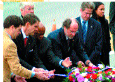
Sen. Sam Brownback (R-KS), Senate Majority Leader Bill Frist, M.D. (R-TN), Rep. John Lewis (D-GA) and Sen. Jon S. Corzine (D-NJ) lay a wreath at the Civil Rights Memorial in Montgomery while Jack Kemp, former Congressman, and Sen. Norm Coleman (R-MN) look on. Sen. Frist and Rep. Lewis co-lead the three-day pilgrimage with Senators Brownback and Corzine acting as honorary co-chairs of the delegation.